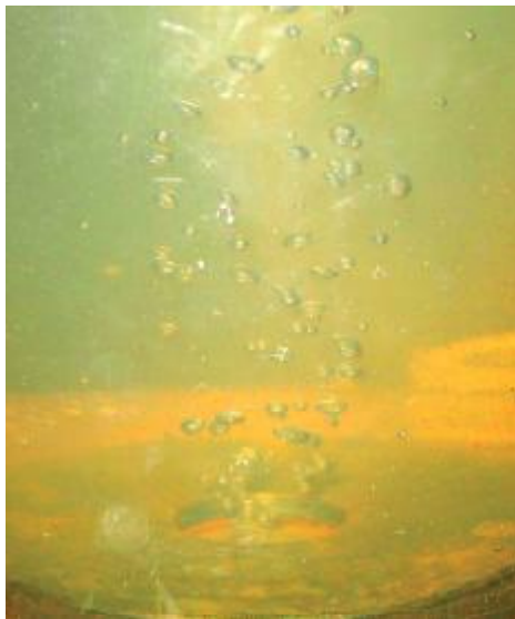
Photo of gas bubbles rising in water from a single laser drilled hole

The SRI Jigger Tubes are positioned under the calandria. They disperse a multitude of small gas bubbles into the massecuite over a wide area and at a position designed to maximise the increase of massecuite circulation. Some vapour accompanies the noxious gases and this passes into the massecuite to boost circulation further.